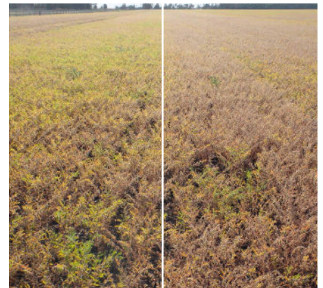
Check (left) vs. 42PHi Rhizo on Chickpeas (right)