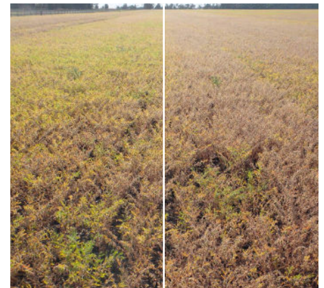
Check (left) vs. 42PHi Rhizo on Chickpeas (right)