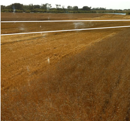
Check (white area) vs 42PHI Cereal on Wheat (front)