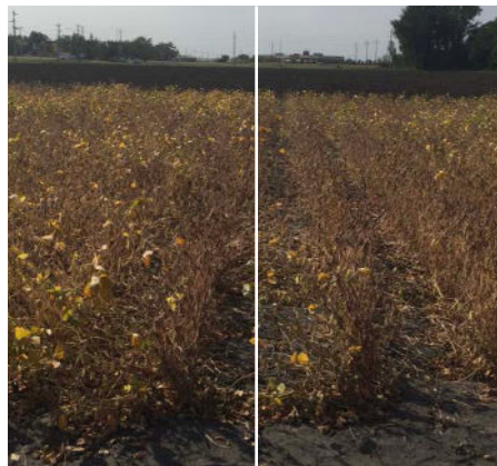
Check (left) vs. 42PHI Rhizo on Soybeans (right)