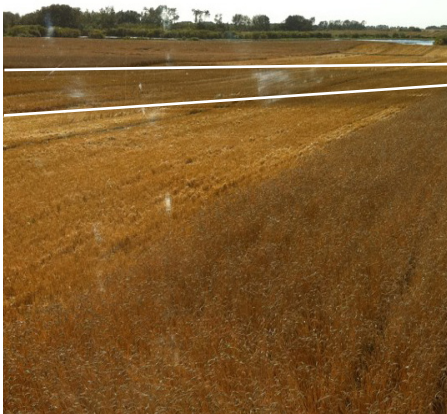
Check (white area) vs 42PHI Cereal on Wheat (front)