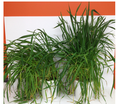
Copper Deficiency (left) vs. Copper Sufficiency in Wheat (right)