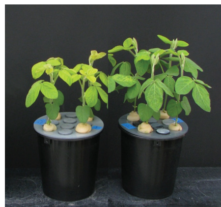
Mn Deficiency (left) vs. ReLeaf Soybean (right) on Soybean