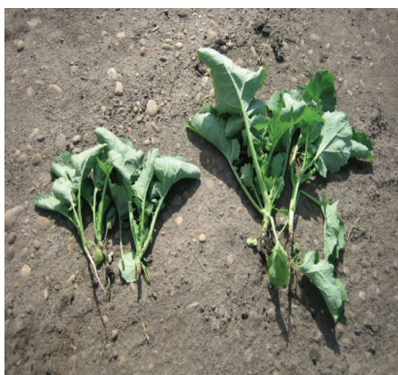
Check (left) vs. ReLeaf Canola (right) on Canola