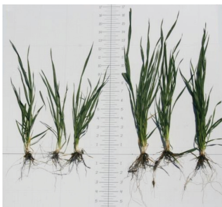
Check (left) vs. ReLeaf Cereal (right) on Wheat