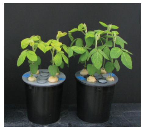
Mn Deficiency (left) vs. ReLeaf Soybean (right)