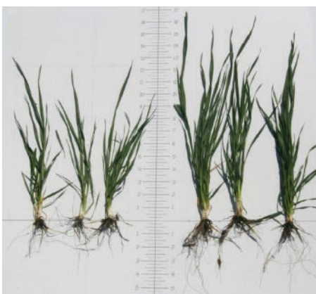
Check (left) vs. ReLeaf Cereal on Wheat (right)