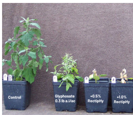
21 DAT (Michigan State University) 475 ppm hard water