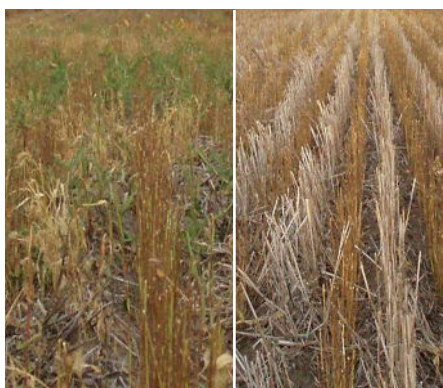
Glyphosate alone (left) vs Glyphosate and RectipHy (right)