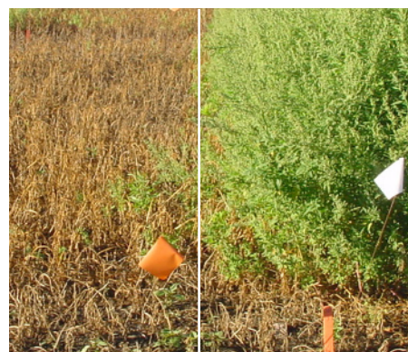
Glyphosate and distilled water (left) vs. Glyphosate only (Ca + Mg at 1000 ppm)