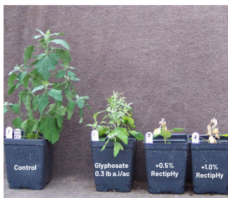
21 DAT (Michigan State University) 475 ppm hard water