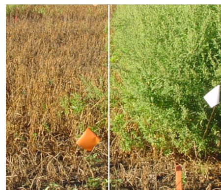
Glyphosate and distilled water (left) vs. Glyphosate only (Ca + Mg at 1000 ppm)