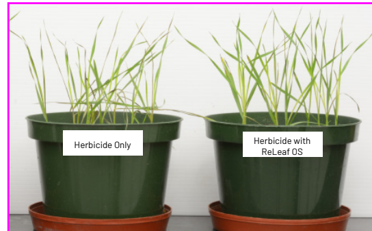
Picture above shows the Day 9 visual results of Talinor compared to Talinor with ReLeaf OS. To view time lapse video visit https://info.concentricag.com/en-us/power-your-crop-with-releaf