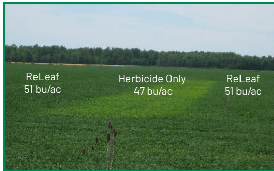
ReLeaf applied at 1 qt/acre at the V5 growth stage with herbicide.